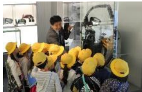
Elementary school student tours (Headquarters)