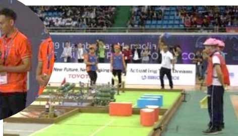
ABU Robot Contest