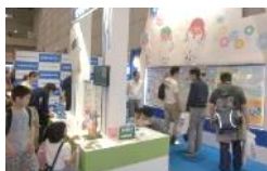
Handicraft event at Shizuoka Hobby Show

In addition to summer vacation classes, children enjoyed wooden crafts using our motors at the Shizuoka Hobby Show in May and at the Chiba Museum of Science and Industry in late August.