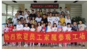
Employee family tours (Jiangsu Mabuchi)