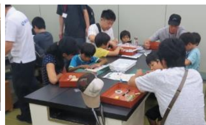
Industrial Science Museum work event