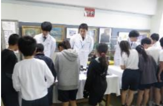
Classes held in a local elementary school (Headquarters)

We have been sending our head office employees to elementary schools in the area (Matsudo City, Chiba Prefecture) as science instructors every year. We have received comments from children, who received classes using science teaching materials developed independently, saying things such as they found science to be fun as they experimented with magnets using motor components.