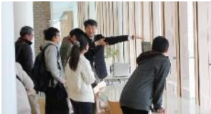
Special school student tours (Headquarters)