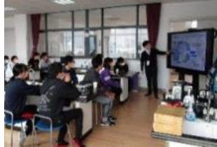
Classes held in the Japanese School (Jiangsu Mabuchi)