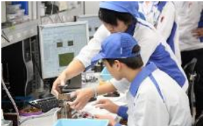
Workplace experience for junior high school students (Headquarters)

Headquarters takes in local elementary school students in cooperation with the career education programs at their schools. Also, our overseas bases are also inviting local students and family members of the employees to observe workplaces.