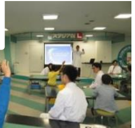
Science experiment class in the Science Museum (Headquarters)