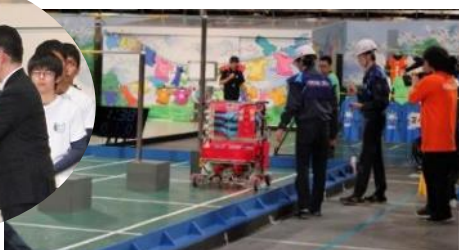
National Technical College Robot Contest