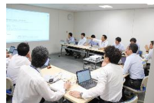
Examination by Bureau Veritas (Headquarters)

Conformance of Mabuchi group environmental management system to the ISO requirements and the current effective management status of the system are periodically audited by an external certification body (third party) and the internal Audit Department. Through these audits, we maintain And improve the level of our environmental management continuously.